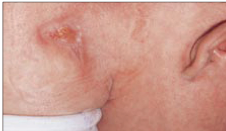
After INTRASITE Conformable