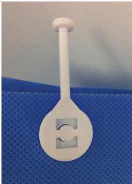
Cubicle Curtain Blue Hook 1 EBOS Code: 35102001 Cubicle Curtain Blue 1 Hook XL EBOS Code: 35102002